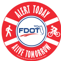
Alert Today Florida

Please take the time to visit some of our partners.