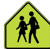
Florida School Crossing Guard Program