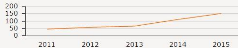
NUMBER OF BREWERIES PER YEAR

2.5 Gallons per 21+ Adult (RANKS 20 TH )