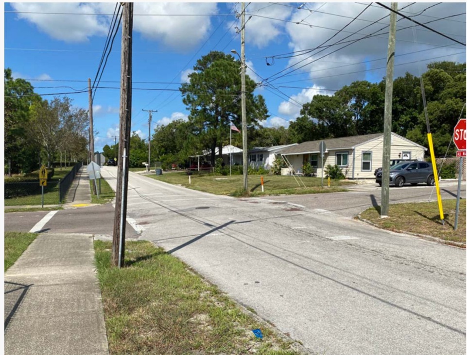
Example Existing Conditions