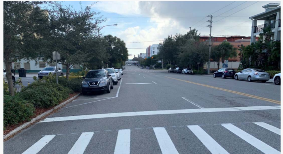
Example Existing Conditions