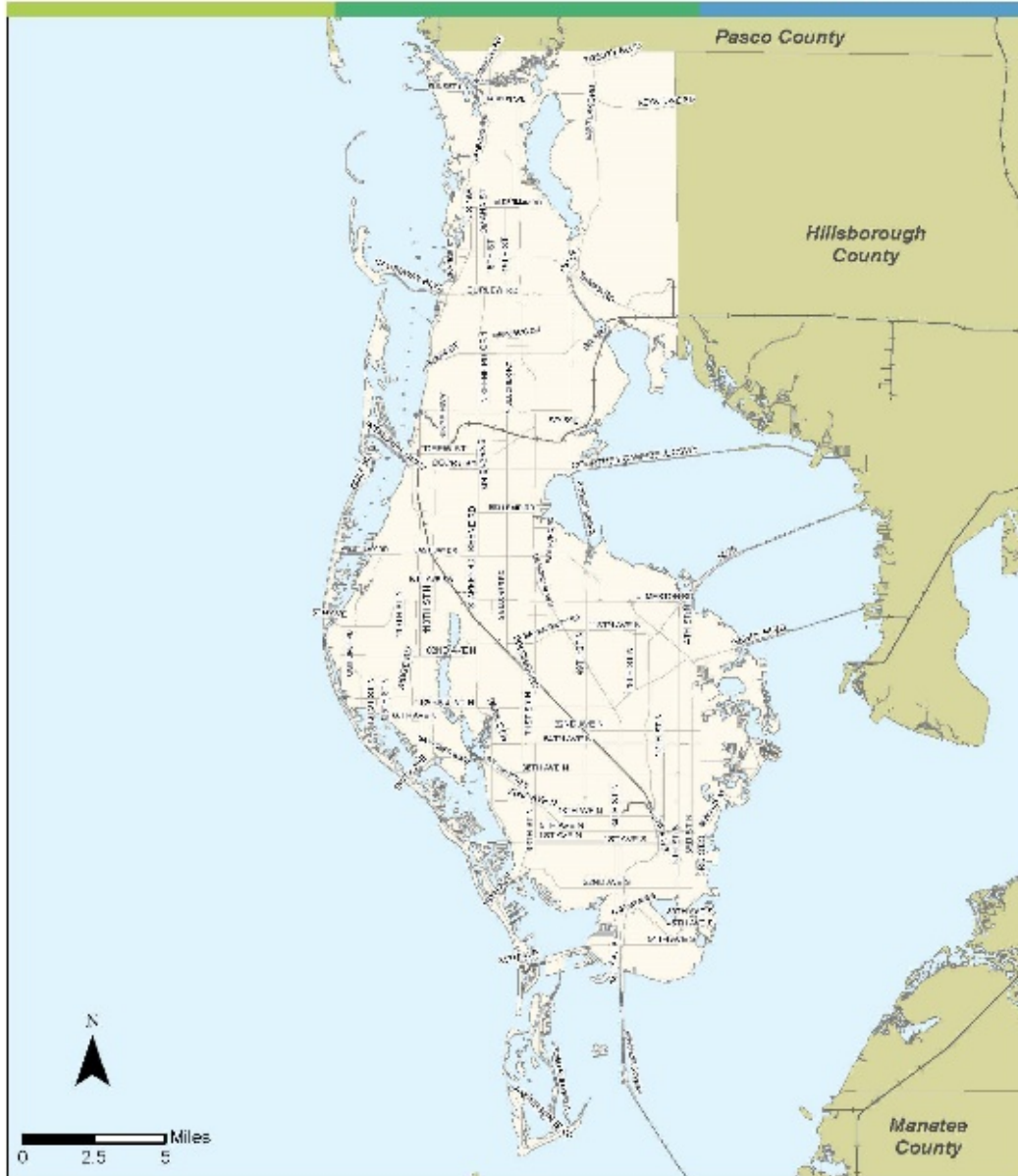
Forward Pinellas Planning Area